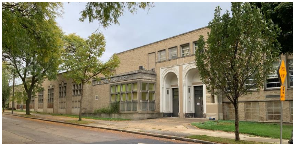
3409 North 37 th Street July 21, 2021

On July 21 st , 2021, after years of conversations and negotiations,, God blessed us to purchased the former Frederick Douglass School building from the City of Milwaukee. We named the school, the Pilgrim Rest Oasis. The Pilgrim Rest Oasis will house the ministries of the Pilgrim Rest Oasis, Inc. and stand as an oasis of refreshment, restoration, and recreation for all who enter its doors, expecting to leave out thinking, feeling and believing differently than when they entered.