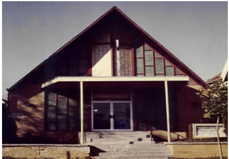
2567 North 8 th Street April 22, 1962

By faith, God cleared a path of distinction and dedication to the community in which we live. And by faith, and God's grace, this family continued to grow thrive and work in this community.