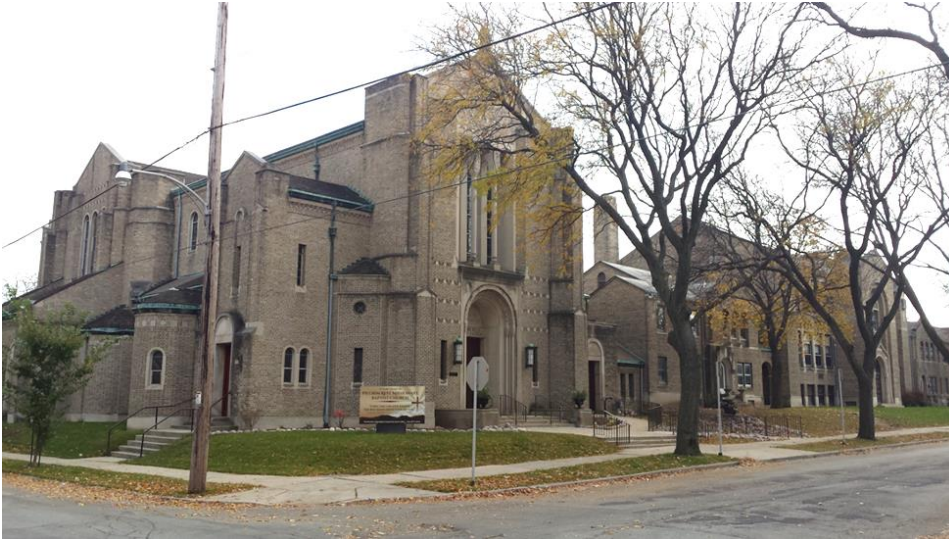
3456 North 38 th Street January 30, 2015

God's plan was so much bigger than that. That meeting led to broader discussions and led us to purchase our fourth edifice.