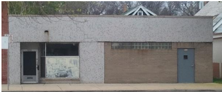
4433-35 West Fond du Lac Avenue April 1, 1992

On April 1, 1992, we purchased the building located at 4433-4435 West Fond du Lac Avenue to expand upon our mission to honor Jesus' command in Matthew 25:40, ...inasmuch as you did it to one of the least of these My brethren [and sisters], you did it to Me , by opening a food pantry and clothing bank. Many in the community who were in need received the love of God exemplified through the hands of God's children in the form of food and clothing. Additionally, they received the Gospel of