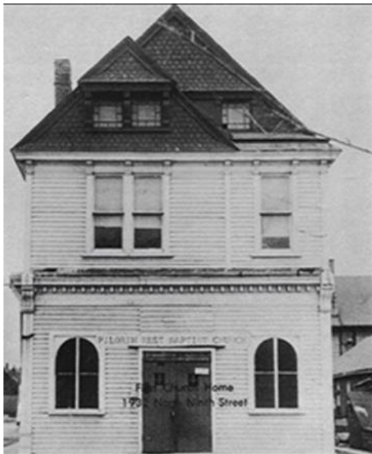
1932 North 9 th Street September 15, 1952