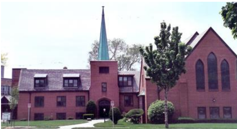
3737 North Sherman Boulevard April 15, 1980