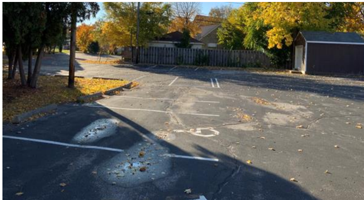
3752-3762 North 44 th Street February 1, 1986

On February 1, 1986, we purchased a tract of land at 3752-3762 North 44 th Street. We had the land leveled, paved and landscaped to be used as our parking lot to facilitate 62 vehicles.