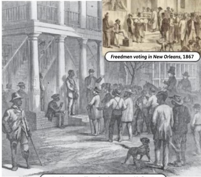
Freedmen voting in New Orleans, 1867

"Black Codes" denied African Americans their basic civil rights in Florida. The laws made it a crime for African American men to be unemployed. If an African American man did not have a job, he could be fined a large amount of money or imprisoned. These laws also prevented African Americans from