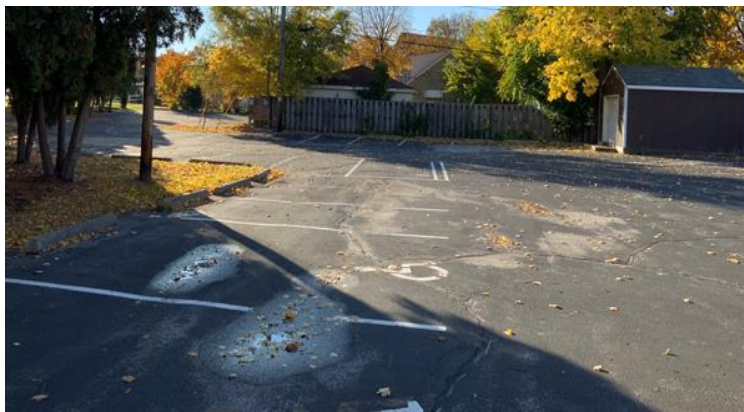
3752-3762 North 44 th Street February 1, 1986

On February 1, 1986, we purchased a tract of land at 3752-3762 North 44 th Street. We had the land leveled, paved and landscaped to be used as our parking lot to facilitate 62 vehicles.