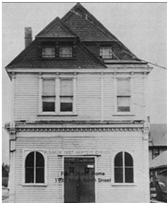
1932 North 9 th Street September 15, 1952