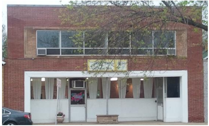
4427-4429 West Fond du Lac Avenue May 1, 1987