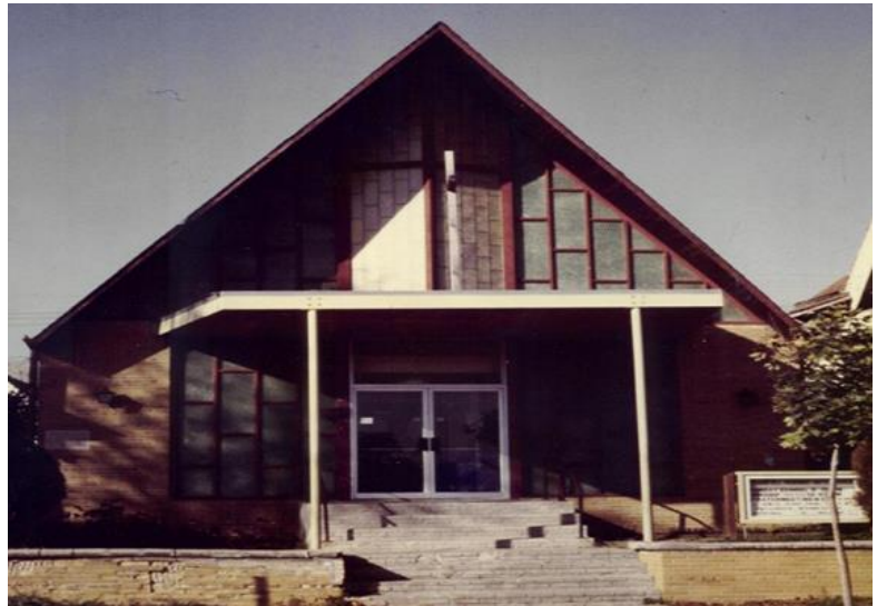
2567 North 8 th Street April 22, 1962