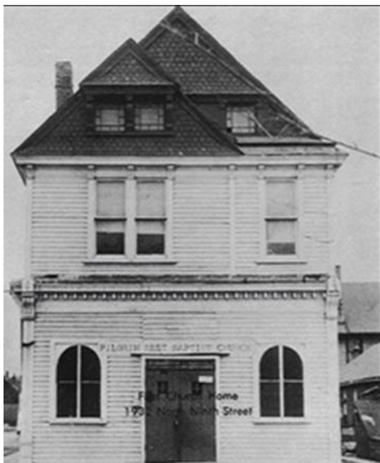
1932 North 9 th Street September 15, 1952