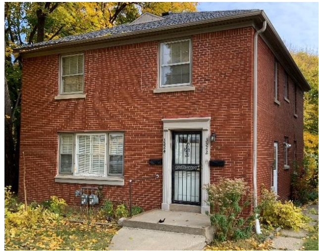
3522-3524 North Sherman Boulevard October 25, 2012