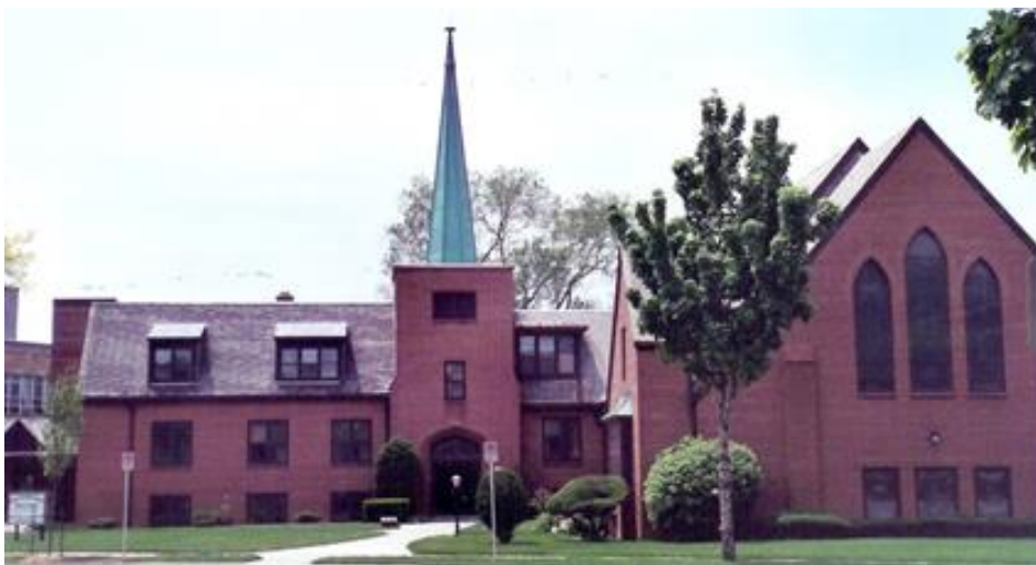
3737 North Sherman Boulevard April 15, 1980