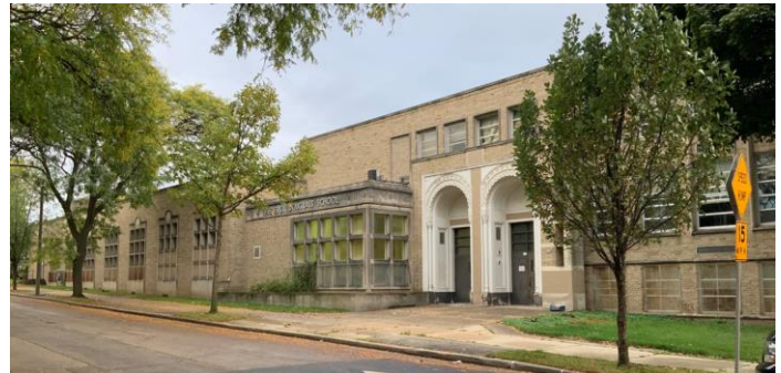
Pilgrim Rest Oasis – 3409 North 37 th Street July 21, 2021

On July 21 st , 2021, we purchased the former Frederick Douglass School building from the City of Milwaukee. We named the school, Pilgrim Rest Oasis, and it will house the ministries of the Pilgrim Rest Oasis, Inc.