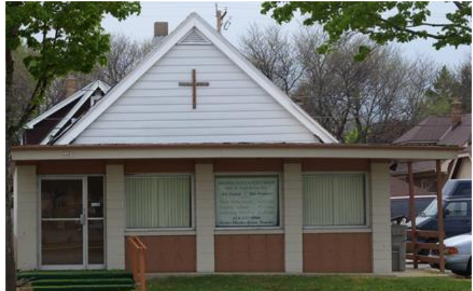
4441 West Fond du Lac Avenue May 1, 2003

Since establishing the church incubator, three newly formed churches have come, received the support and assistance they needed and moved into their own buildings to fulfill God's call for them.