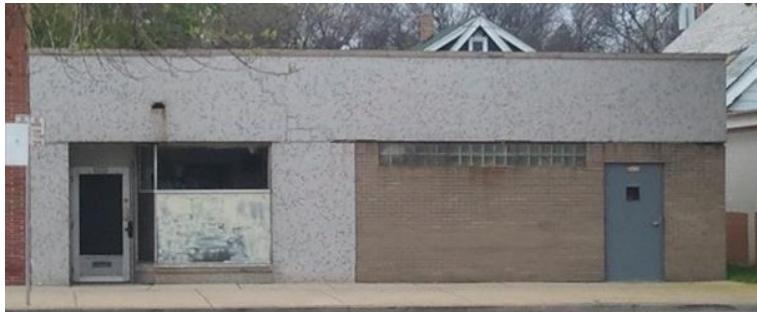
4433-35 West Fond du Lac Avenue April 1, 1992

At Pilgrim Rest West, we held Outreach Sunday School Classes, tutoring for school-aged children, a space for our youth and children to safely gather for social and recreational activities, a space for our adults to gather for family activities and our Summer Learning Camp. Numerous people were ministered to in this building who had never entered a church edifice. This building would later be used as a business incubator, providing opportunity for new businesses to start, develop and build the capacity to be successful. Many have fond memories of this space that was simply referred to as, "The Center".