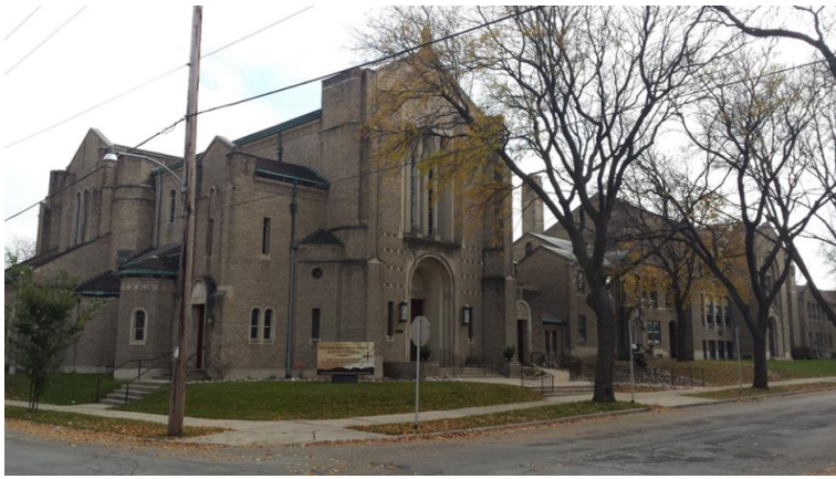
3456 North 38 th Street January 30, 2015

Community Center (A center to support and invigorate the capacity of residents to thrive in recreation, athletics, performing arts, technology, along with other areas of their lives) and a Community Venue (A venue to support and encourage the creative and innovative work of our neighbors while gathering to discuss and debate, as well as GED/HSED and continuing education classes for adults, intergenerational gatherings, and more.