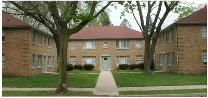
3602 - 3606 North Sherman Boulevard 3700 - 3708 - 3712 North Sherman Boulevard June 29, 2007

On _____, we established the New Life Ministry to assist women who were in need of _____