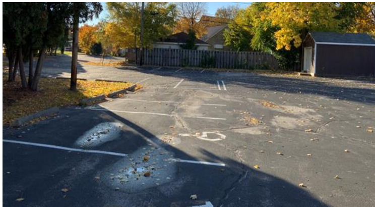
3752-3762 North 44 th Street February 1, 1986

On February 1, 1986, we purchased a tract of land at 3752-3762 North 44 th Street. We had the land leveled, paved and landscaped to be used as our parking lot to facilitate 62 vehicles.