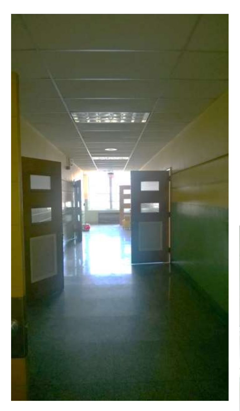
2<sup>nd</sup> Floor Hall