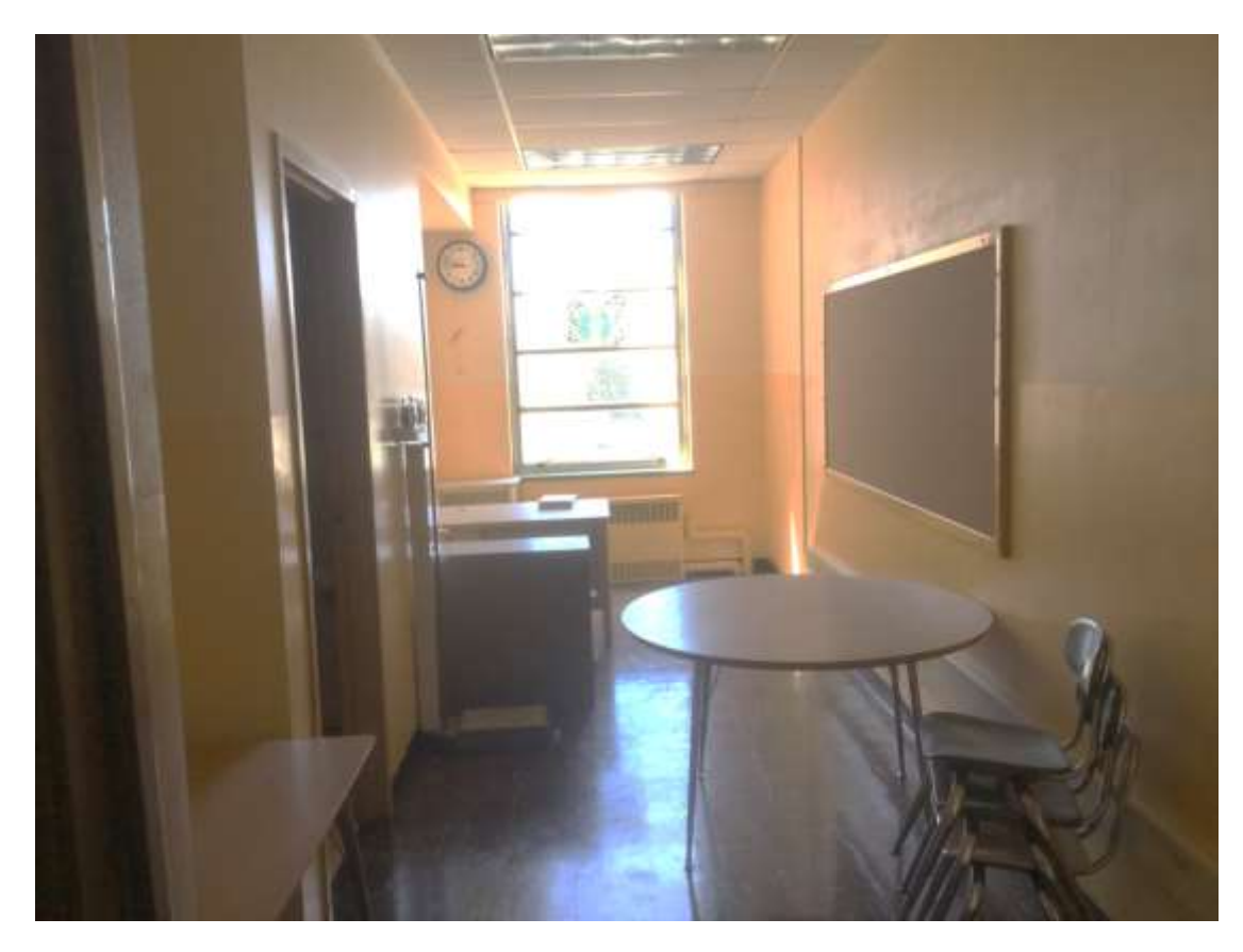
Social Worker / Psychologist / Therapist Office