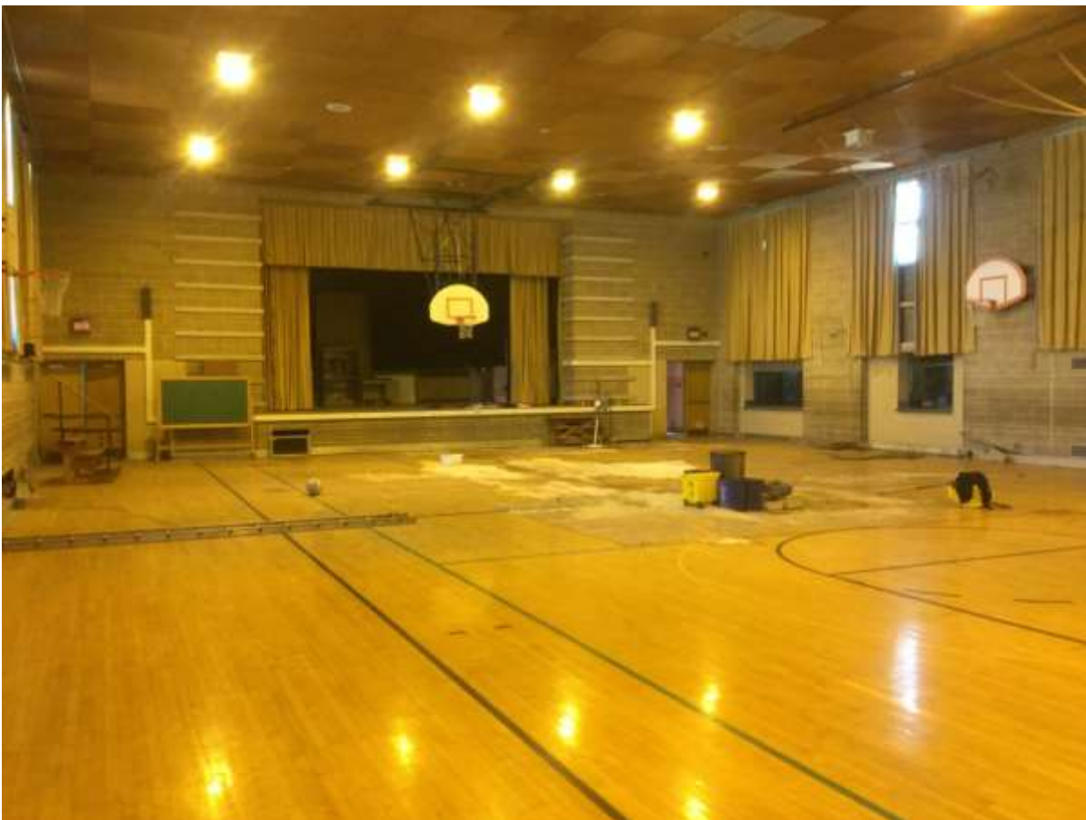
Gym / Stage