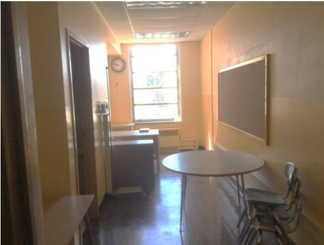
Social Worker / Psychologist / Therapist Office