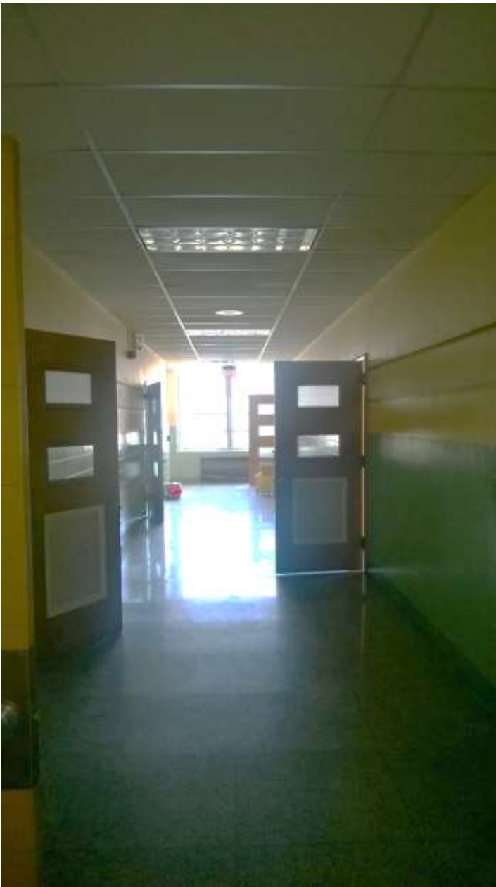
2 nd Floor Hall